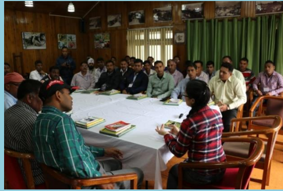
Participants of Wildlife Trade Workshop