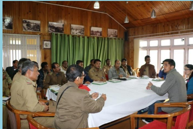
104 th Batch Dr/Fr Trainees of West Bengal Forest School, Dow-Hill