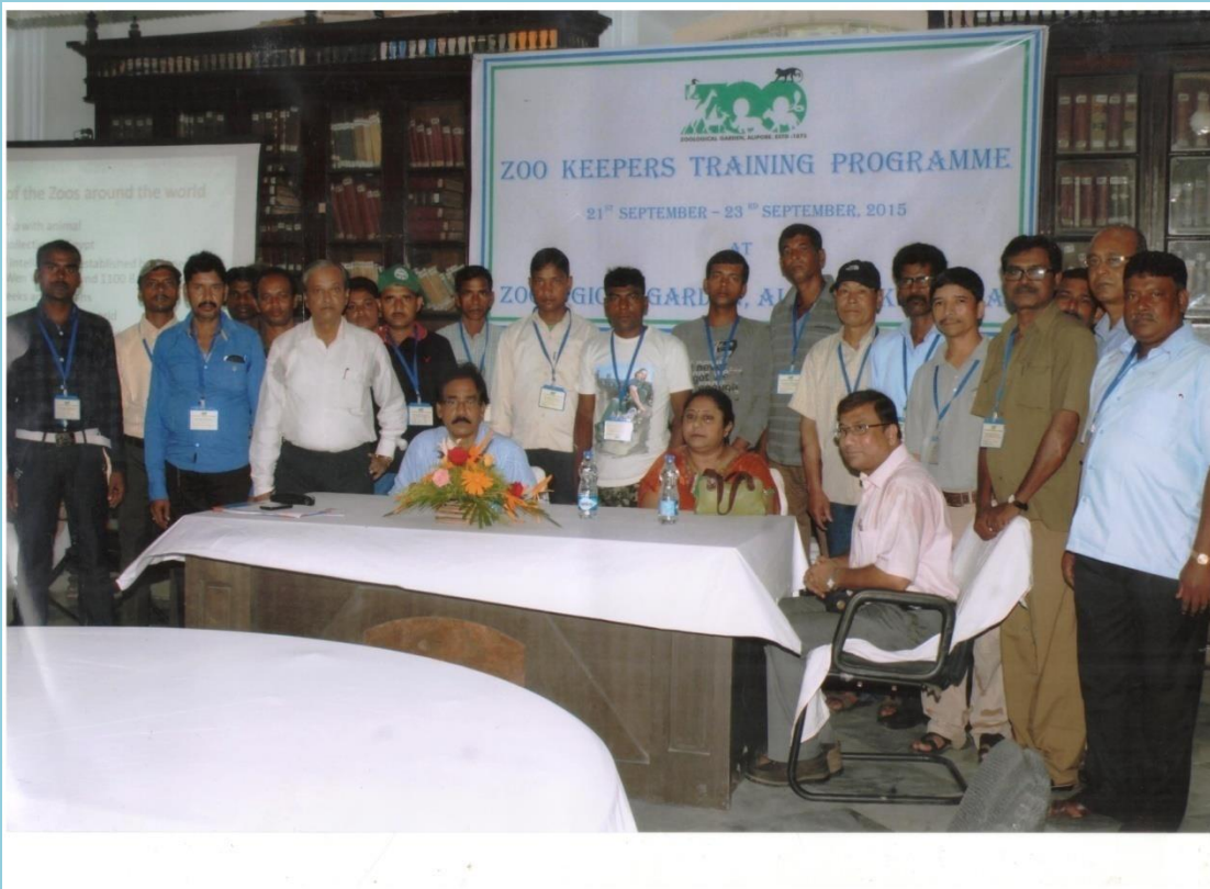
Zoo Keepers Training Programme at Zoological Garden, Alipore