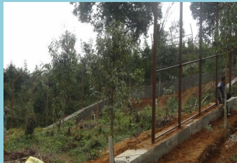
Construction of New Snow Leopard Enclosure