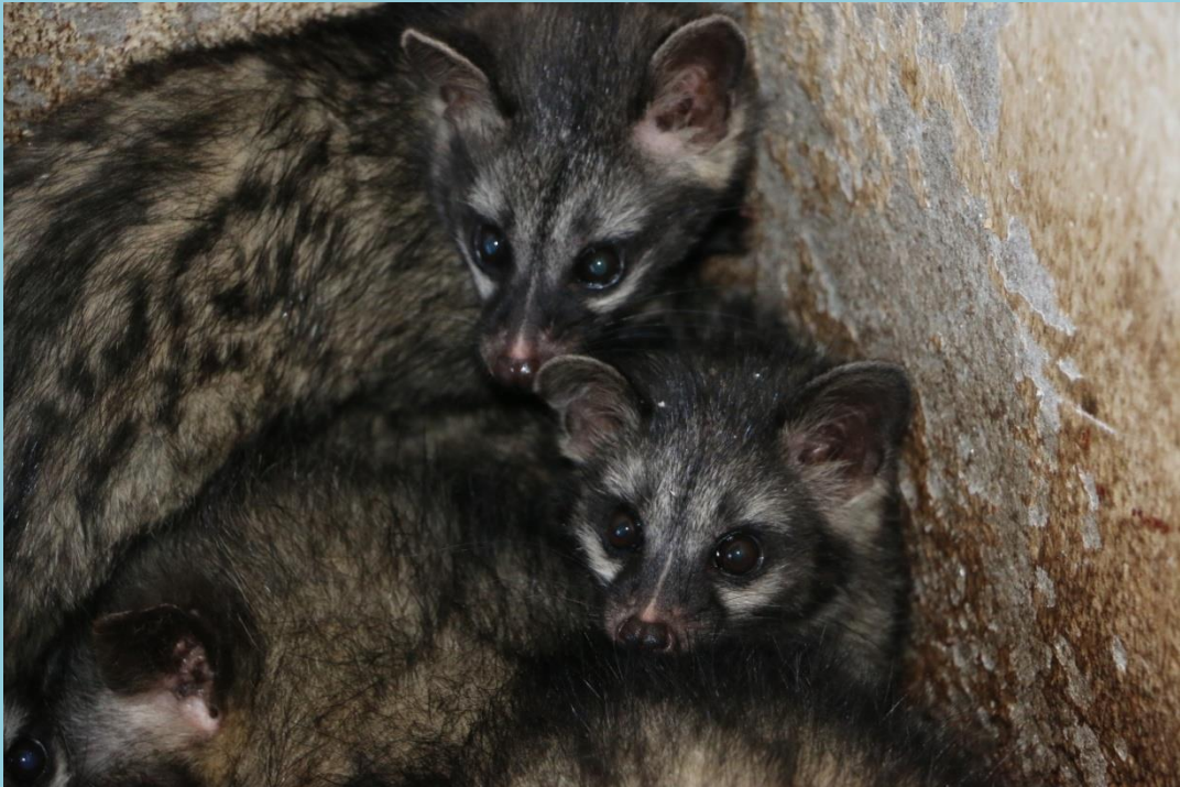
Juvenile Asian Palm Civet ( Paradoxurus hermaphoditus )