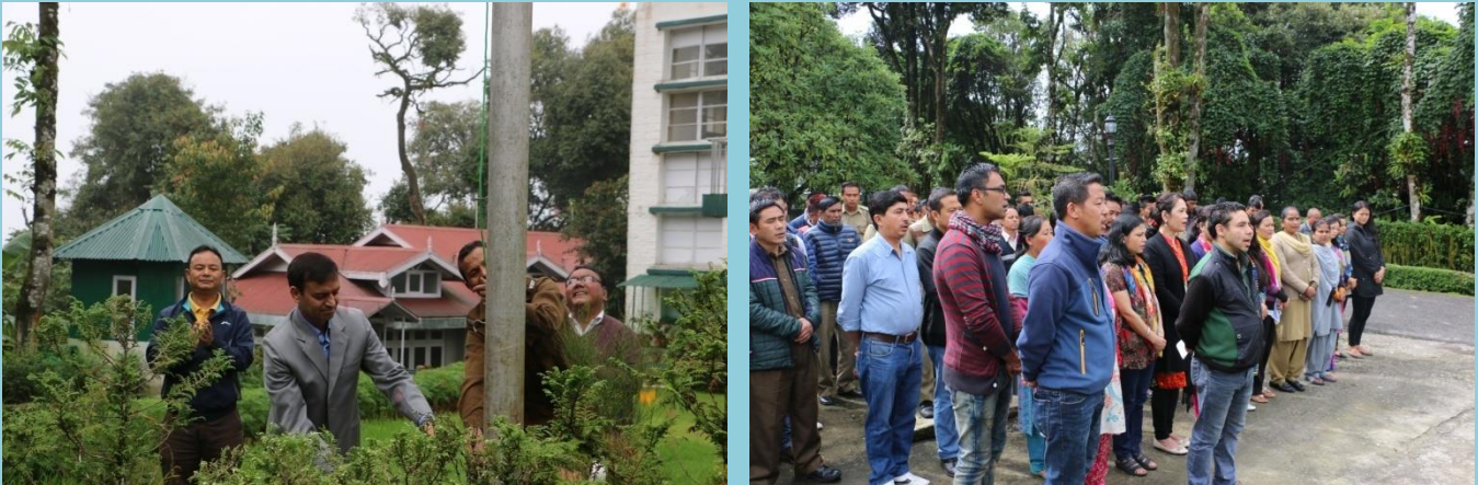
Foundation Day Celebration 2015