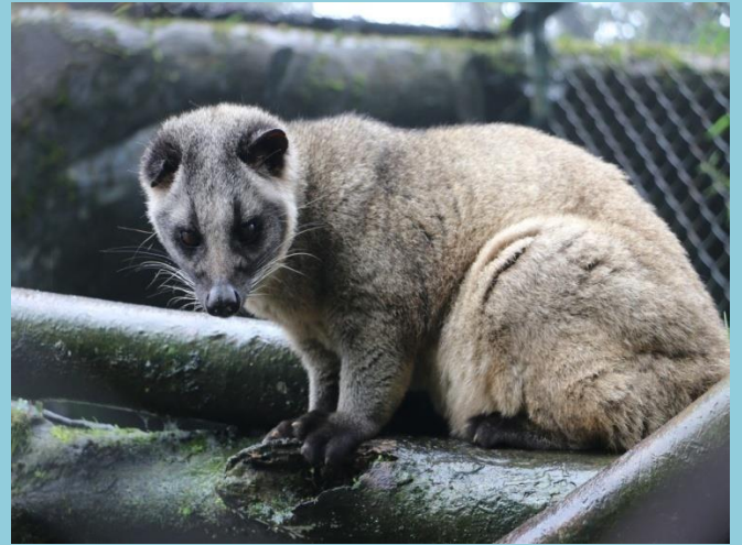
Himalayan Palm Civet ( Pamuga larvata )