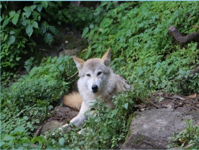
Himalayan Wolf ( Canis lupus himalayensis )